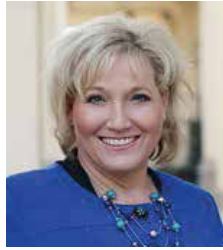
Loan Officer NMLS # 1479296